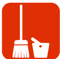
STAND CLEANING SERVICE