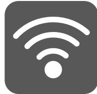
TELECOMMUNICATIONS AND NETWORKS